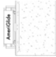
0° Inline Left Hand