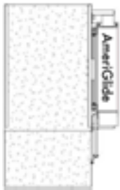
Straight Thru Right Hand